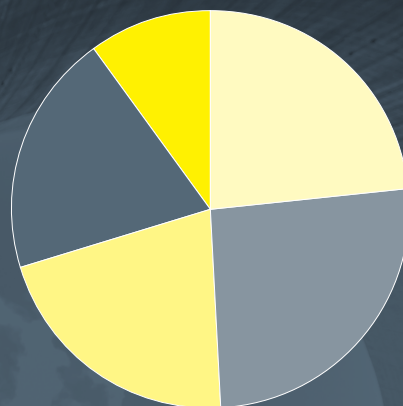
MEMBER AGES of members providing a DOB

In order to become more sustainable, Nuclear Future is now being naked mailed. For those companies with a CSR/Net Zero commitment, we have the opportunity for a half page advertising space on the Outside Back Cover position – directly below the mailing stamp.